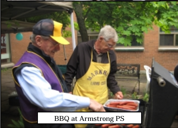
BBQ at Armstrong PS