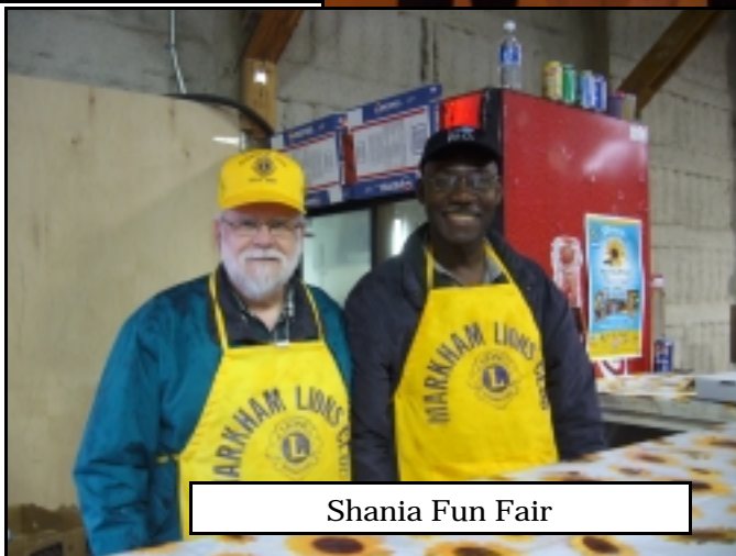
Shania Fun Fair