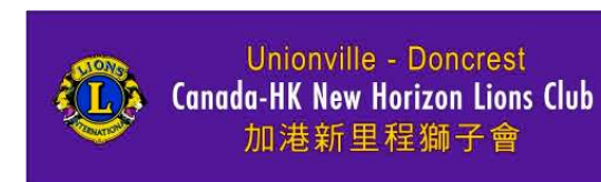
New Horizon Lions Club